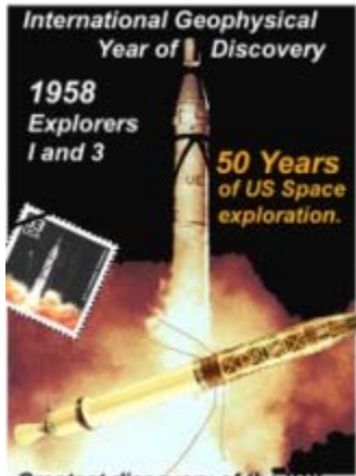
Greatest discovery of the IGY Van Allen Belts