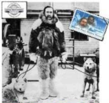
On July 17, 1908, Robert Peary led an expedition to the North Pole with his assistant Matthew A. Henson & four Inuits.