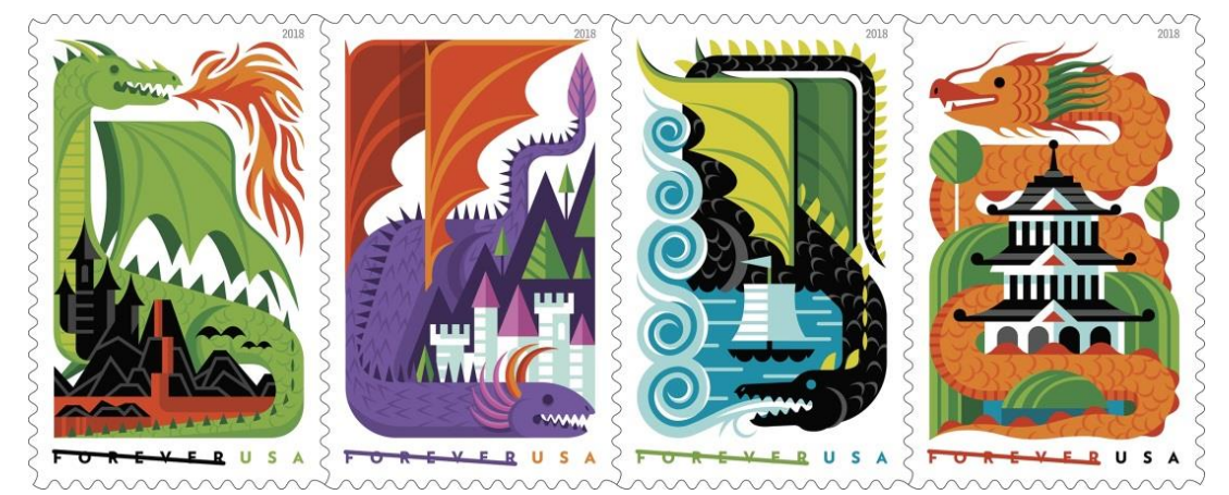
The U.S. Postal Service unveiled four colorful stamp designs depicting dragons at APS StampShow/National Topical Stamp Show, Aug. 9-12 in Columbus, Ohio.

https://www.rmpldenver.org/publications/videos.html?start=12